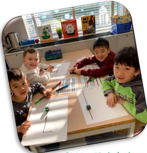
Division 14 students are introduced to coding using little robots called Ozobots.